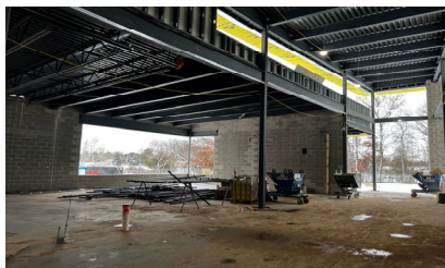
The empty spaces are for windows that will bring natural light into the classrooms.