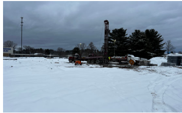
The team is drilling holes, over 500ft down for our geothermal system.