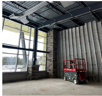
The fitness room will include a lot of natural daylight and natural stone.